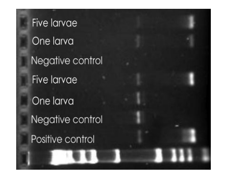
Fig. 2. Sensitivity tests of the molecular marker using samples spiked with a known number of larvae of Linnoperna fortunei .

No false negatives were detected in the studied samples. Interestingly, there were two instances in which light microscopy failed to detect golden mussel larvae,